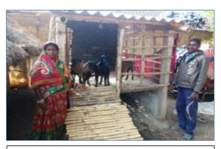
Improved Goatery Shed with the Black Bengal Goats & Kids in HDF-cDAR-DST Project, Musagadia, Badasahi block, Mayurbhanj.