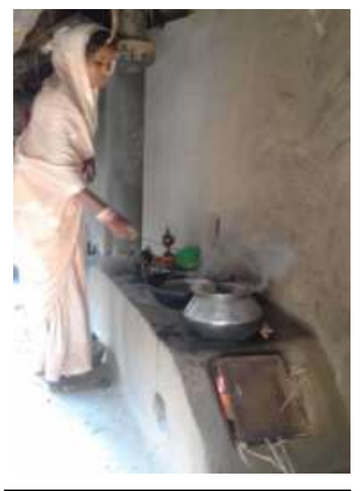
Cooking in Improved Smokeless Chulla (IIS, Bangalore Model) in

20 nos. BPL SC households have adopted improved goatary farming with a supply of "Black Bengal breed" suitable to the local environment. The breed has the excellent mutton quality among all Indian breeds with multiple kidding behavior i.e.2 /4/6 kids per kidding with 3 kidding in 2 years.